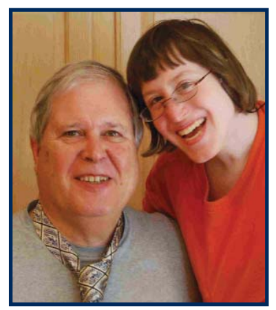
by Ira Cotton

In case you're wondering, the picture shows a bit of Fathers Day fun with my older daughter who had just presented me with a stamp tie with a woven image of Scott 114, the U.S. 3¢ ultramarine of 1869 portraying an old locomotive. You might not recognize it from this small photo,