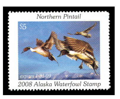
The 2008 Alaska stamp.

program has run its course; it is no longer an effective revenue source, nor is it worth the cost of program administration. Over the long term, the Alaska duck stamp print program has been one of the most sustainable and