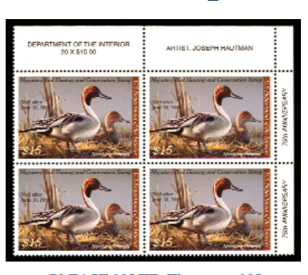
PLEASE NOTE: There are NO PLATE NUMBERS on the sheets.

Margin blocks and singles are available, but each corner will have the artist name - Joseph Hautman and 75th Anniversary instead of the usual plate number. If you ordered a plate block or plate number single, this is what you will receive.