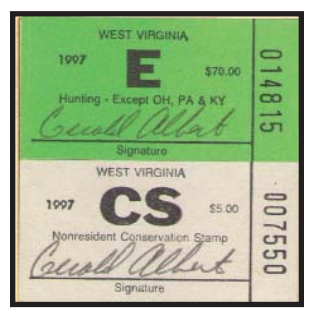
West Virginia self-adhesive stamp.

West Virginia also has a fair number of self-adhesive stamps that have not been fully catalogued. Here's a pair of West Virginia stamps I have not seen catalogued. Presumably, different fees apply for the adjacent states of Ohio, Pennsylvania and Kentucky. These stamps might have been required for water-