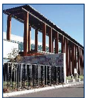
Bloomington Art Center

After 75 years of supporting wetlands acquisition throughout the United States, the Federal Duck Stamp Program continues