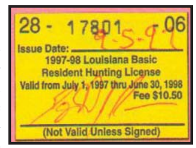
Louisiana text stamp.

Both Florida and Louisiana have issued text-only license stickers that are not listed in published catalog, though Howard Richoux' online catalog -Ducks2k.com -lists and illustrates some examples, and the draft of